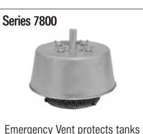
against rupture or explosion resulting from excessive internal pressure caused by exposure to fires.

Pipe-Away Pressure Vacuum Relief Vent for applications that require hazardous vapors be processed into manifolded piping and not released into the atmosphere